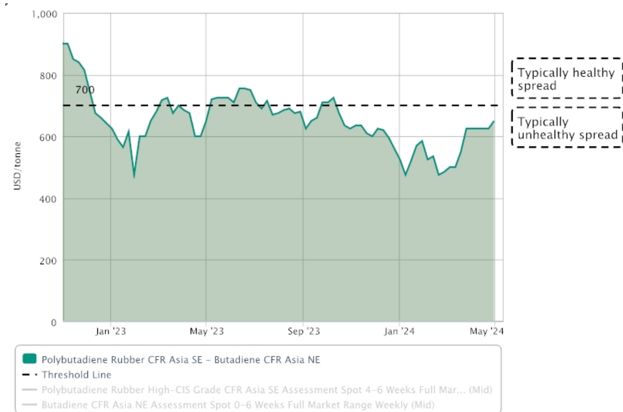
Downstream spread – butadiene NE Asia and PBR SE Asia

The chart below shows that the spread between butadiene and PBR is picking up but still remains in the unhealthy zone.