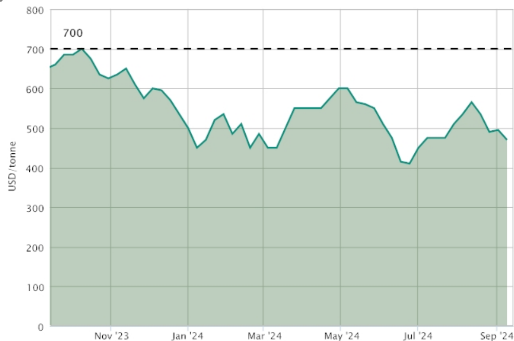
Spread between Butadiene and Styrene Butadiene Rubber Asia

Typically healthy spread Typically unhealthy spread