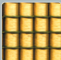
BEAD WIRE & RADIAL TYRE CORD

Various carbon blacks such as N220, N234, N299, N326, N330, N339, N347, N375, N539, N550, N650, N660, N772.